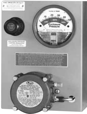
WPS Style (With Pressure Switch)