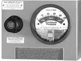
LPS Style (Less Pressure Switch)